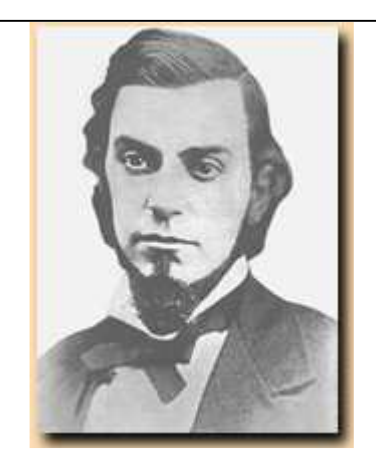
Charles Taze Russell, founder 1879